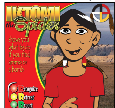
Coloring books teach children the “3Rs” of UXO safety: Recognize, Retreat, Report.

For further information about the Air Force Retained Area, see the Administrative Record (see instructions on the left ).